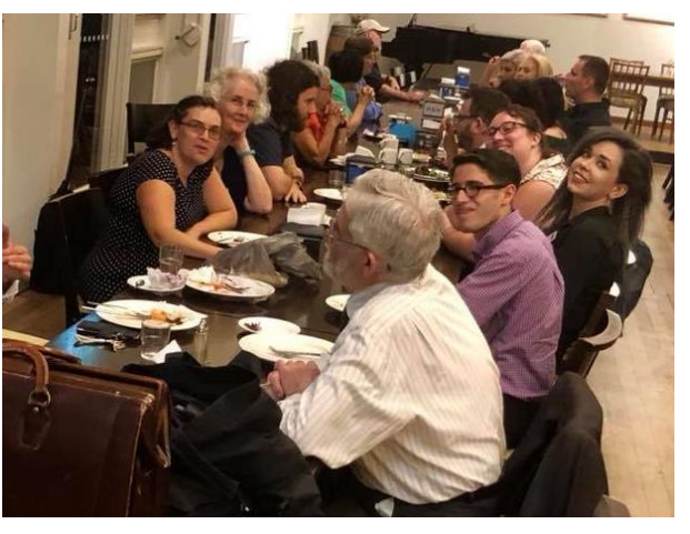
Delegates enjoy a convivial College conference dinner!