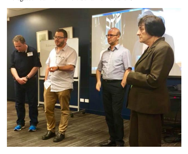
Panelists field questions in the Jewish Community forum