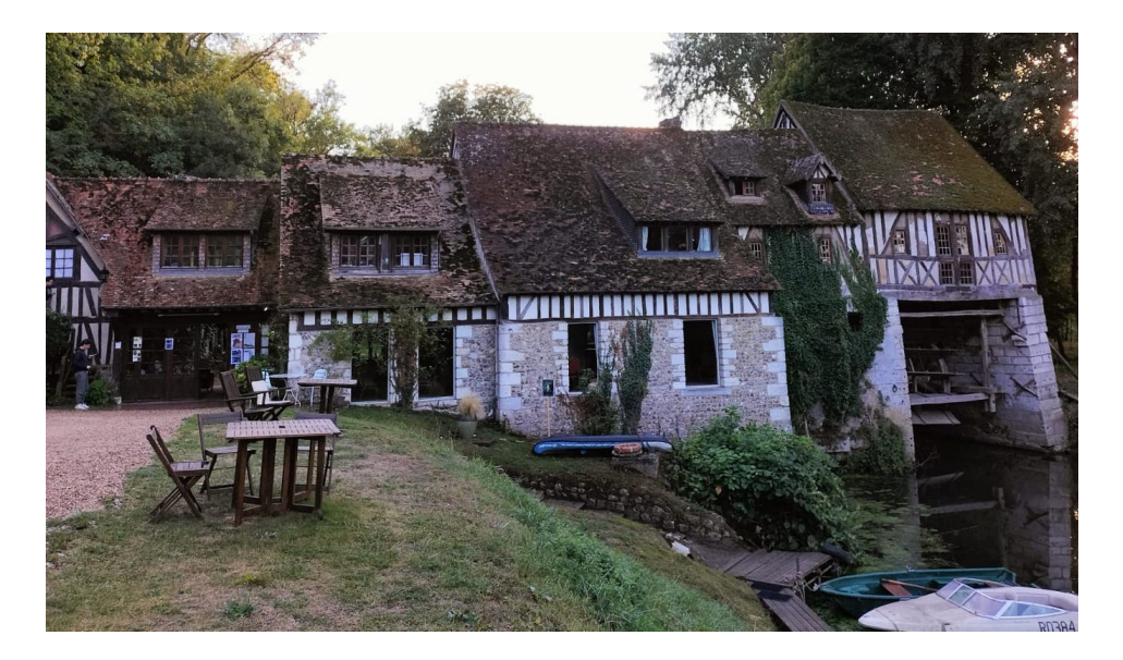
Figure 1: The Moulin d'Andé.